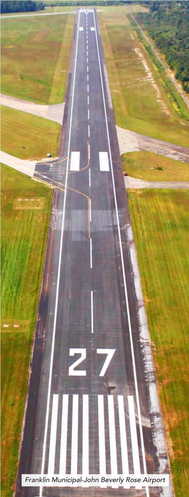
Franklin Municipal-John Beverly Rose Airport