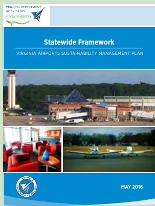
SMP Statewide Framework

*A comprehensive list of all goals associated with each category and subcategory is provided in each of the SMP Supplements