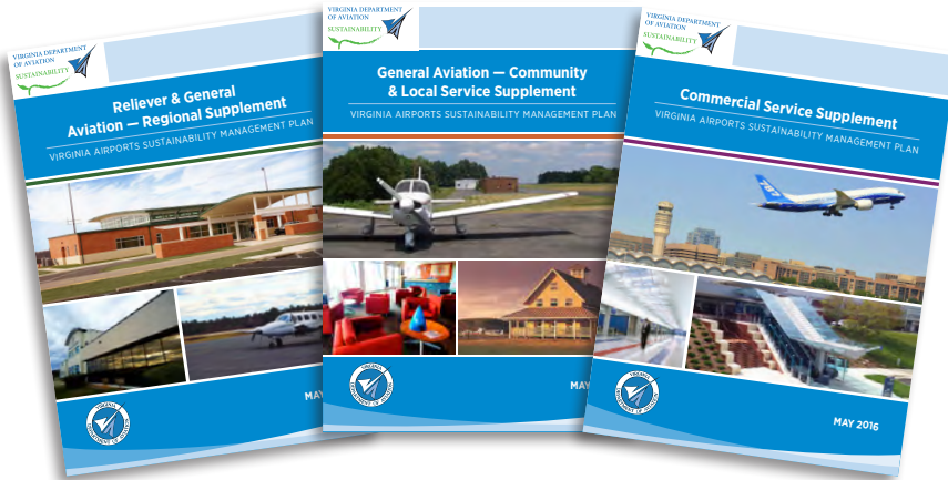
SMP Supplements for three categories of airports

The Supplements focus on implementation and tangible outcomes. Each one starts by introducing a set of the best existing tools and resources for overall sustainability planning at airports within the given category. This introduction is followed by a detailed examination of recommended sustainability goals, metrics, targets, and initiatives for airports in the type/size tier to consider within the sustainability categories of the SMP. For each of the 12 sustainability subcategories, the document presents one to three specific goals that are most relevant and meaningful for airport sustainability management. The document articulates the rationale for considering each sustainability goal, useful metrics for measuring progress, suggested numerical performance targets within each metric, and possible tangible initiatives to carry out in support of the goal.