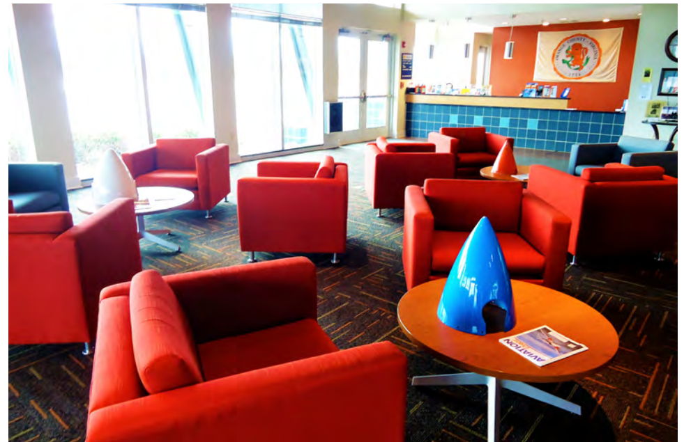
Orange County Airport terminal showing use of natural lighting

Three Supplements and associated appendices provide sustainability planning guidance and suggested sustainability goals, metrics, targets, and initiatives relevant to the corresponding type and size of airport. The purpose of the Supplements is to ensure that airport operators have access to practical resources that are appropriate to the complexity of their airport's operations and that assist in advancing sustainability efforts while minimizing the burden on busy personnel and limited airport resources.