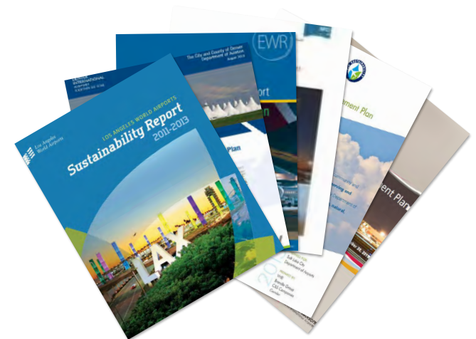
Sustainability plans from airports around the country informed the development of the Virginia Airports SMP