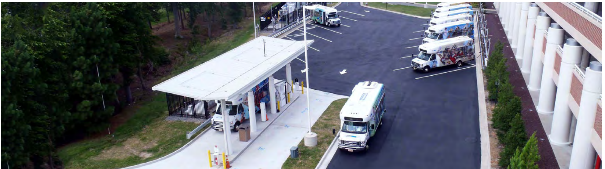
CNG refueling station, Richmond International Airport

The development of DOAV's Sustainability Management Plan was funded by the U.S. Federal Aviation Administration (FAA) Airport Improvement Program (AIP) and the Virginia Department of Aviation (DOAV). The SMP Project was supported by a team of consultants led by The Cadmus Group, Inc.