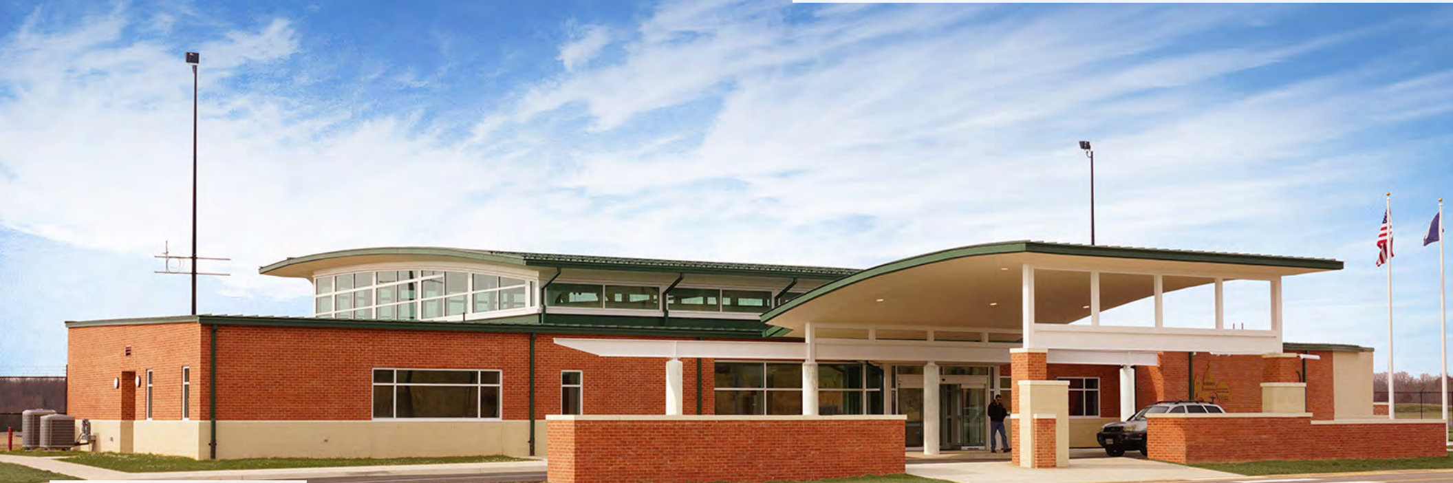
Stafford Regional Airport Terminal

With this document, airports have a curated list of potential funding sources to explore after selecting the sustainability initiatives they wish to pursue. The document also provides broader advice on how to explore partnerships with local governments, businesses, and other non-governmental organizations, and links to external resources on strategies to increase and diversify airport revenue.