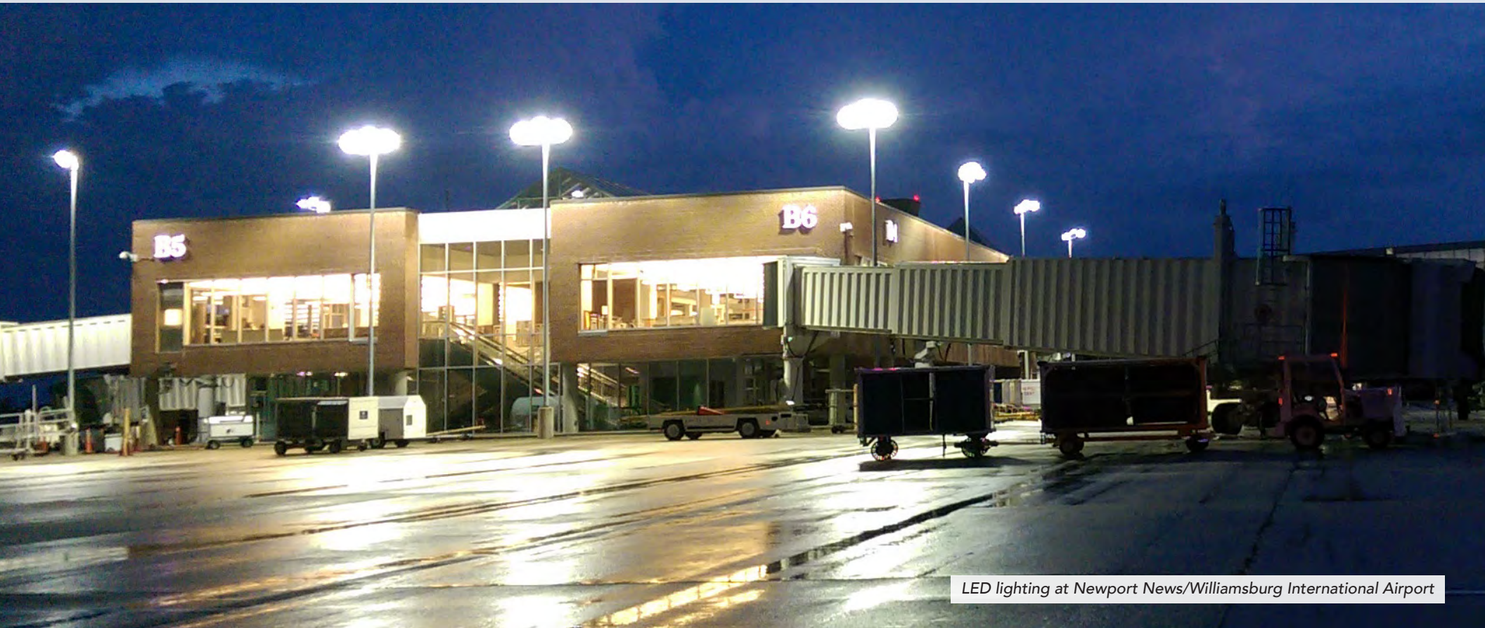
LED lighting at Newport News/Williamsburg International Airport

The Virginia Airports SMP includes a Statewide Framework document that sets the overall vision for sustainability in the Commonwealth and introduces the SMP's main sustainability categories. Additionally, to make the resources relevant to the various types and sizes of airports in Virginia, DOAV developed SMP Supplements that further define specific goals, metrics, targets, and possible sustainability initiatives for three general categories of airports. Each supplement is accompanied by additional documents providing guidance on funding opportunities, stakeholder engagement, and utility performance tracking specific to the particular airport category. The SMP and supplementary resources are available for download at: www.doav.virginia.gov/Sustainability.htm .